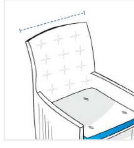
2. Width: Width of the Chair