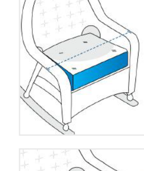
2. Width: Width of the Chair

4. Front Height: Front Height - Ground to Arm (Or ground to seat if no arm)