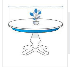
2. Diameter: Diameter of the Round Table

We encourage you to upload the image of the article you need the cover for - this helps our team ensure covers are designed keeping your requirements in mind.